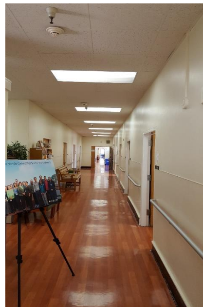
C-5 – Space Renovated for Medical Social Services