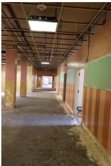
C-2 – To Be Renovated for Medical Staff Offices