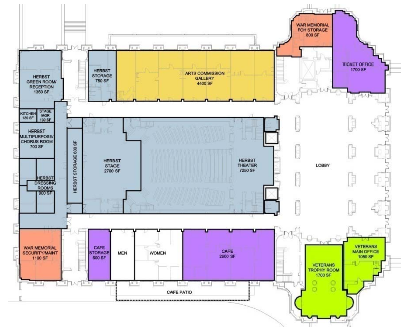
Veterans Building 1 st Floor