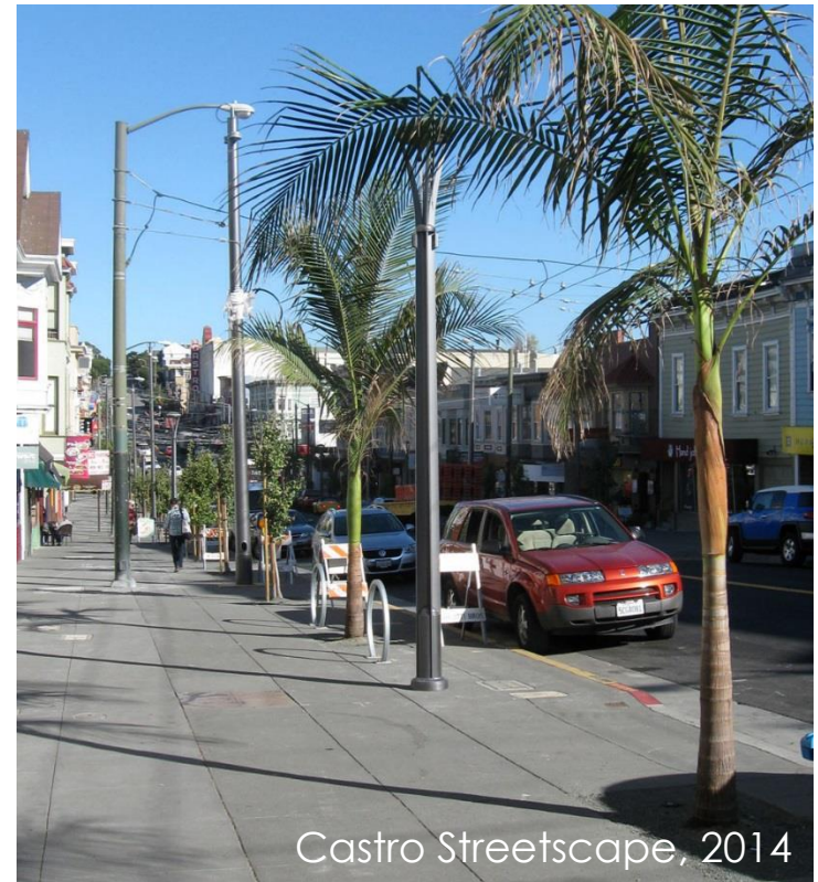
Castro Streetscape, 2014