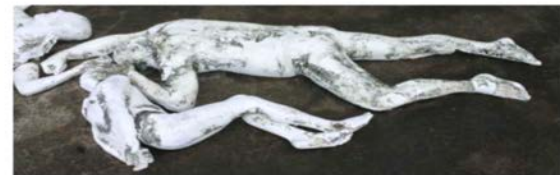
Man and Boy Before Treatment