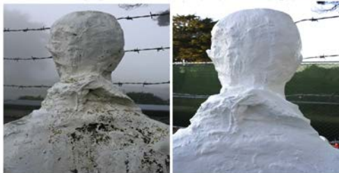
Standing Figure Detail of Back of Head Before Treatment (Left) and After (Right)