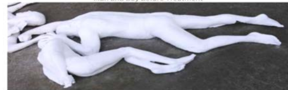
Man and Boy After Treatment