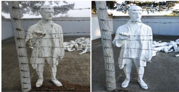
Standing Figure Before Treatment (Left) and After (Right)