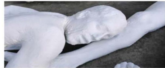
Face Detail After Treatment