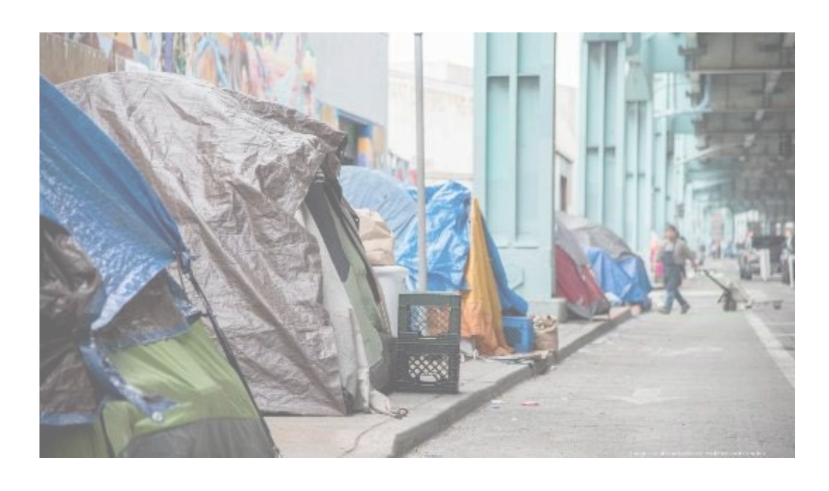
Expand homeless services sites to serve City's 3,500 unsheltered population

• Update life safety systems at City-owned shelters.