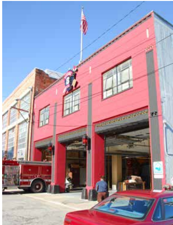
Fire Station 8

To better cover the west side of the city with pressurized water for emergency firefighting purposes, San Francisco envisions a Potable Emergency Firefighting Water System consisting of over 14 miles of new, seismically resilient high-pressure pipelines. The looping pipeline network would be supplied with four water sources at two strategic locations with delivery expected in two phases. A combination of SFPUC water revenue bonds and ESER 2020 G.O. Bonds are planned to fund Phase 1 and ESER 2027 G.O. Bonds expected to support Phase 2.