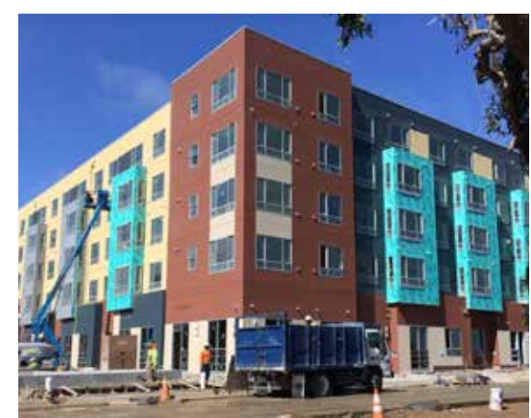
Alice Griffith Construction

Altogether MOHCD's portfolio of affordable housing now includes more than 21,000 units for seniors, families, formerly homeless individuals, and people with disabilities. The affordable housing that MOHCD supports is developed, owned and managed by private non-profit and for-profit entities that leverage City subsidies with state and federal resources to create permanent affordable housing opportunities.