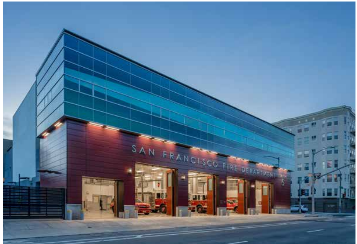
Fire Station 5

With previous ESER funds critical reliability upgrades have been made at three primary water sources and two pump stations, the system's pipelines