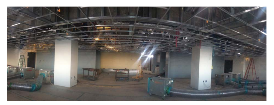
6H Surge (Ward 6H) – above ceiling utilities