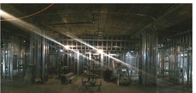
Rehab Dept Relocation (Ward 3G) - wall framing