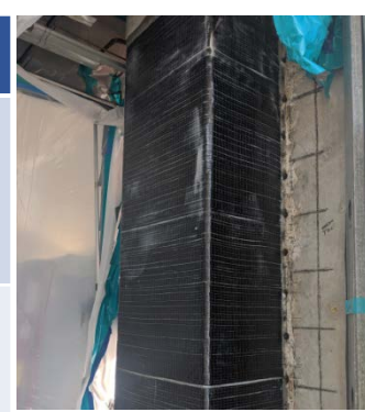
Seismic Upgrade – column strengthening w/ fiberwrap

Southeast Health Center Phase 2 – Design completed. Currently in bidding phase. Advertised in October 2019 with bids due in Dec 2019.