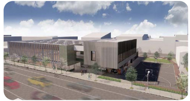
Concept Design (Sept 2019)