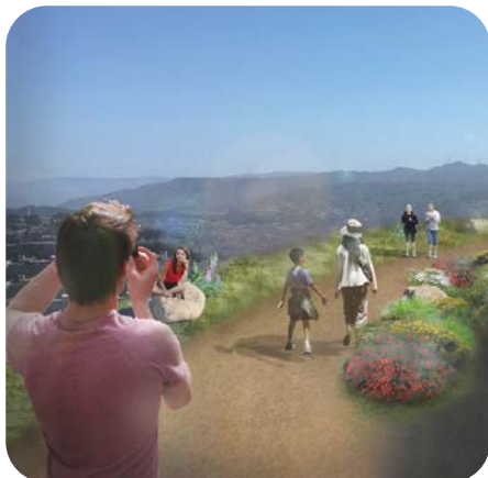
Rendering of Twin Peaks Promenade