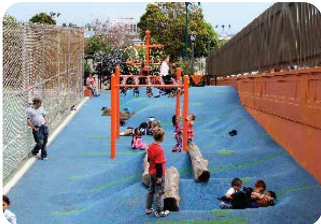
COF project at Duboce Park