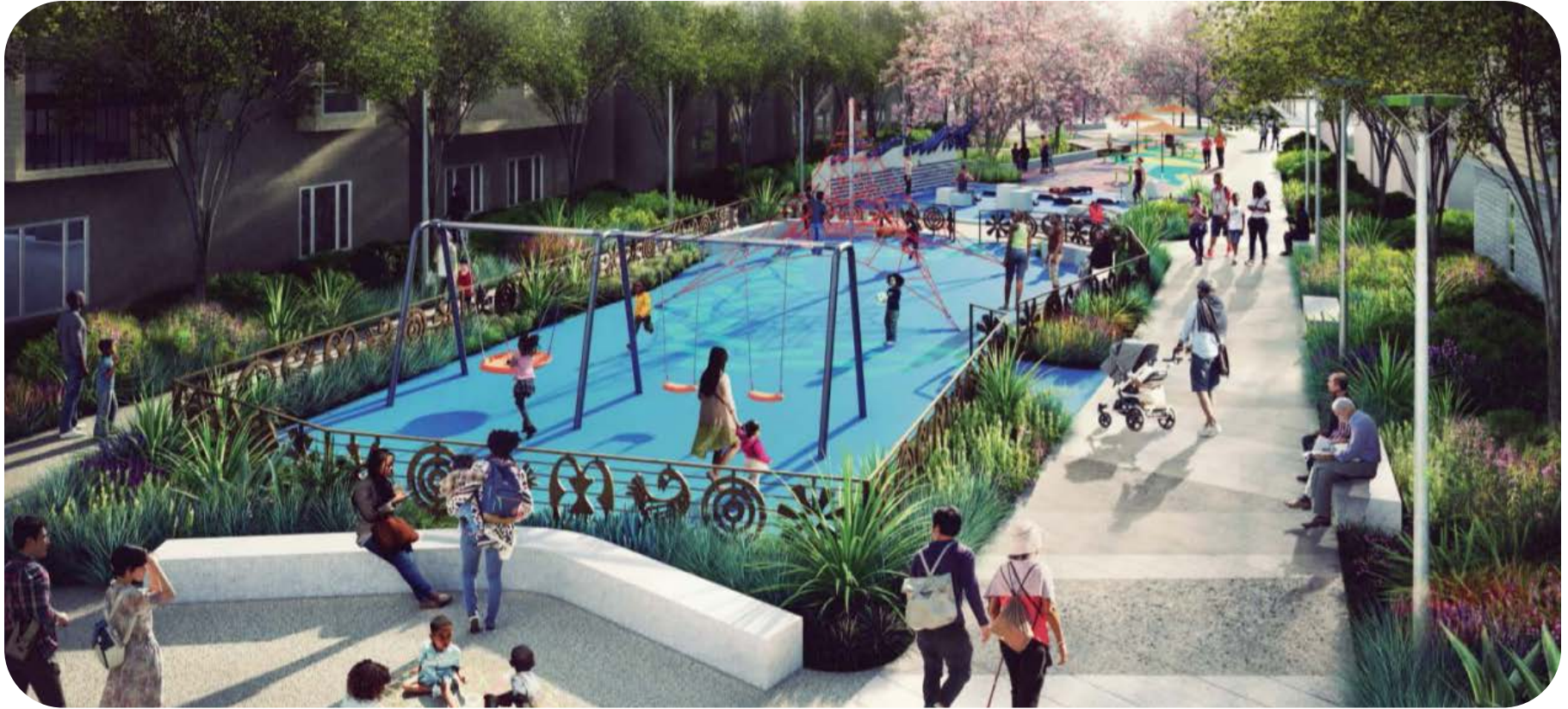
Turk to Golden Gate Concept Design