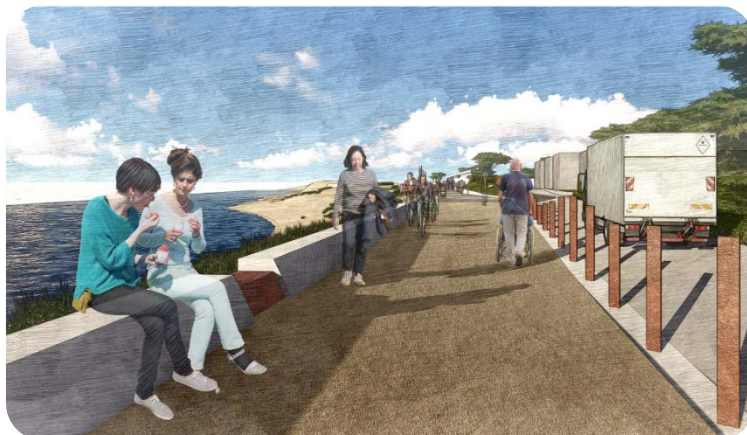
Rendering of South Ocean Beach Coastal Trail