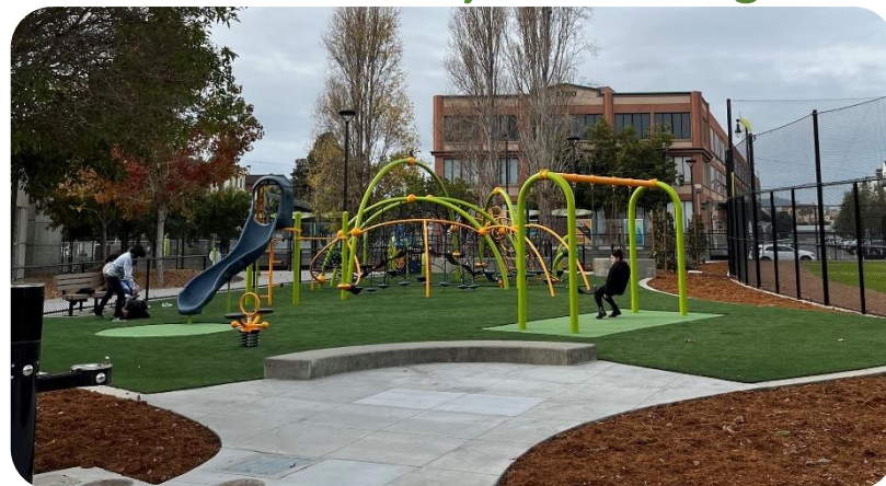
COF Project at Bayview Playground