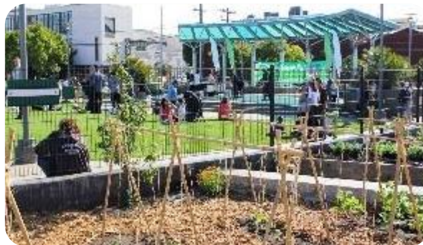
Community Garden at In Chan Kajaal