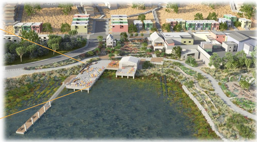
Rendering: new park at 900 Innes