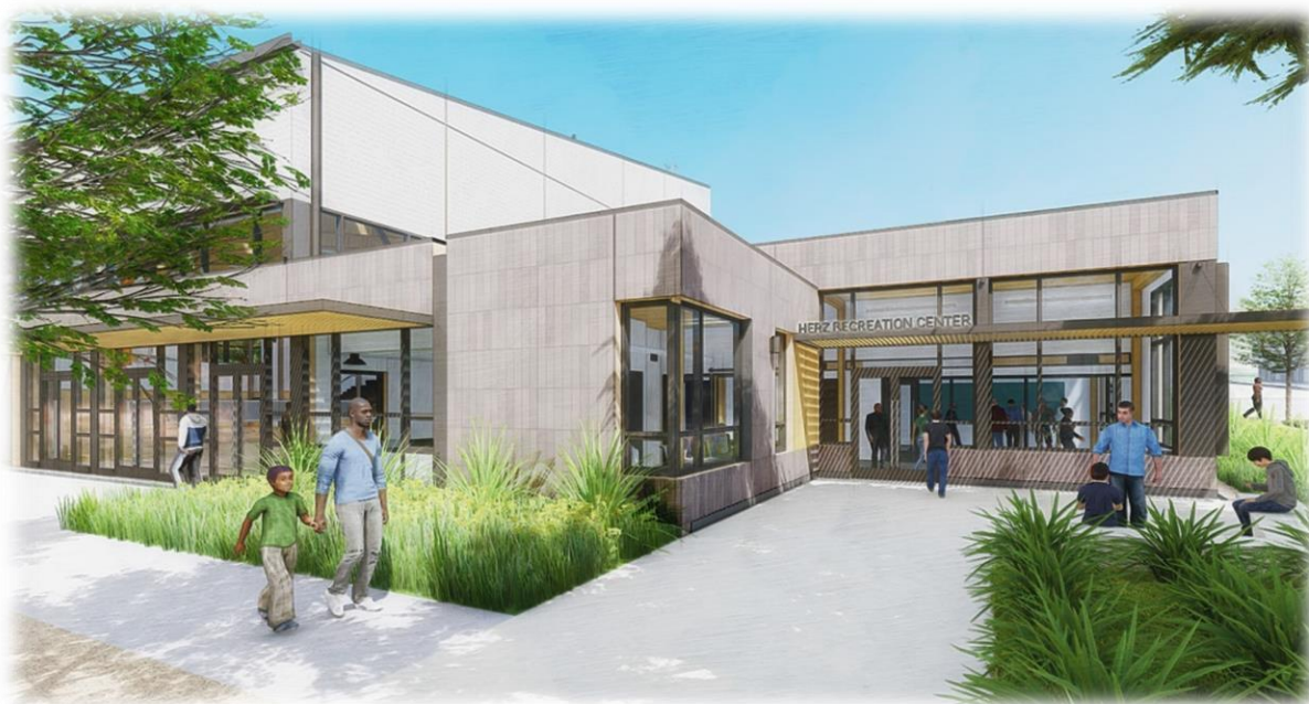
Renderings of Fitness Terrace & Recreation Center