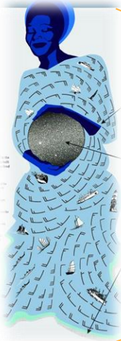
Lady Bayview installation on Pier