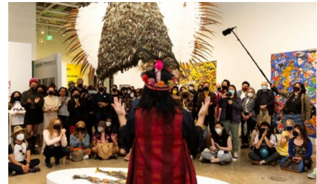
Carlos Villa: Roots and Reinvention. First-ever museum retrospective of iconic SF born Filipino American Artist.