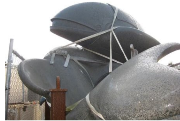
Proposed FY 24 Restoration Project at main City College Campus, The Whales, 1939 by Robert Howard.