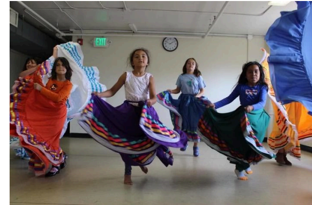
Youth dance classes at Mission Cultural Center for Latino Arts, upcoming seismic and renovation project.