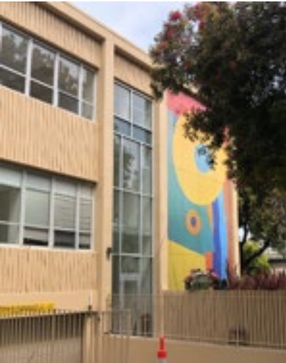
New Concrete Shearwall