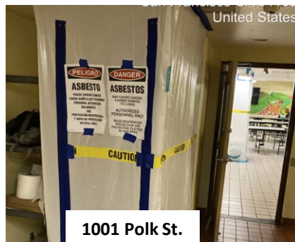
1001 Polk St.