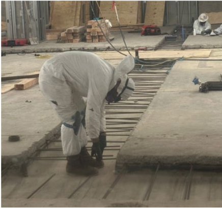
Public Health Lab