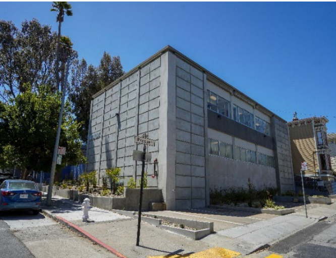
New Concrete Shearwall