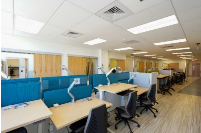
Clinical Team Workspace