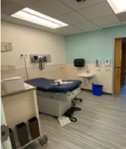
Typical Exam Room