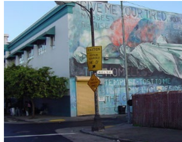
525 5 th Street