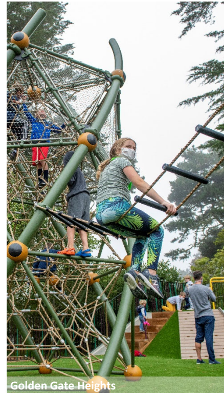
Golden Gate Heights