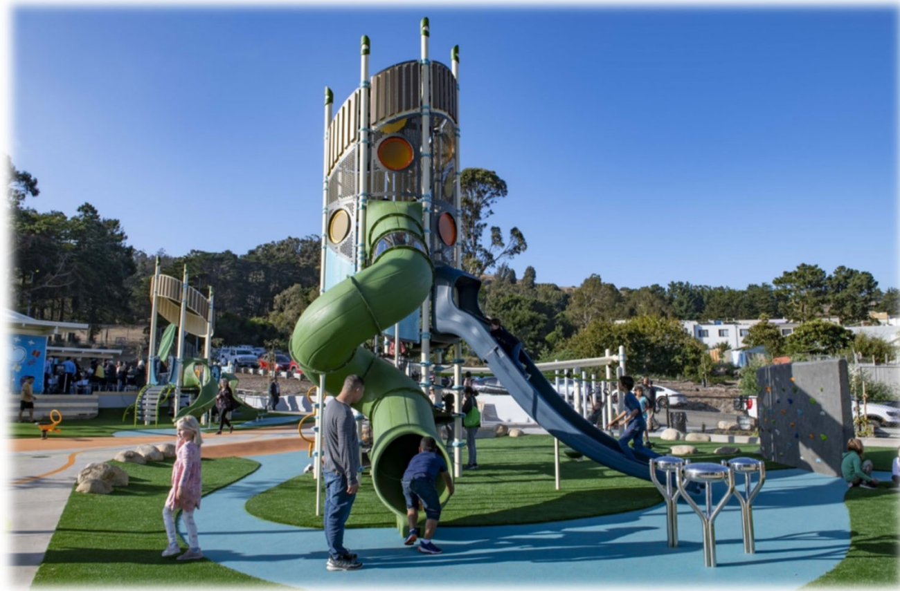
Herz Playground June 24, 2024