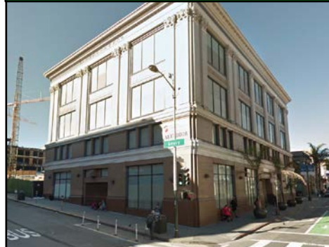
1001 Polk St. Next Door Adult Shelter Capacity: 334 beds

Request: $2M for design and pre-bond planning