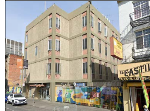
260 Golden Gate Ave. Hamilton Family Shelter Capacity: 175 beds

Replacement shelter partially funded by 2024 Vibrant GO Bond