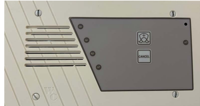
LHH Nurse Call System