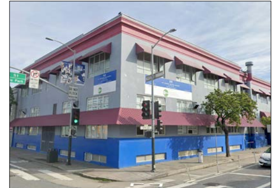
525 5 th St. MSC South Adult Shelter Capacity: 329 beds