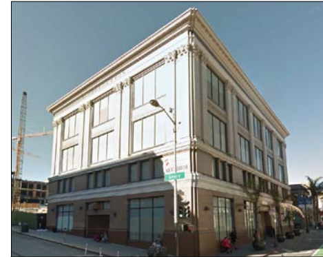
1001 Polk St. Next Door Adult Shelter Capacity: 334 beds