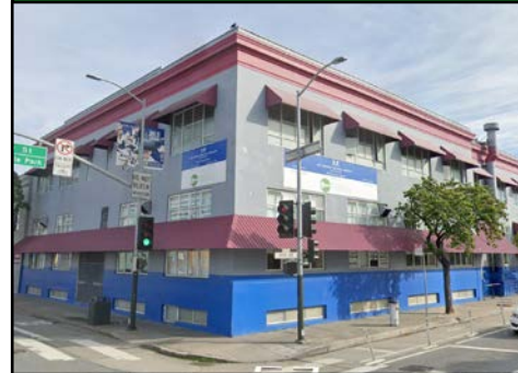
525 5 th St. MSC South Adult Shelter Capacity: 329 beds

Request: $1.2M for design and pre-bond planning