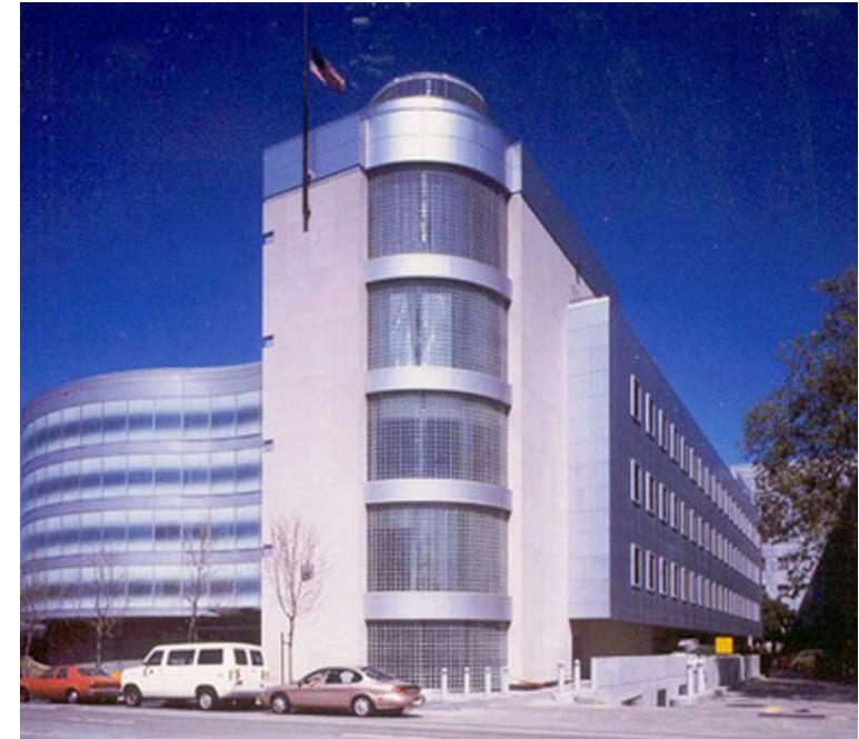
One of four SHF jail buildings with fire/life-safety systems past their useful life.