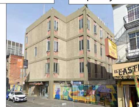
260 Golden Gate Ave. Hamilton Family Shelter Capacity: 175 beds