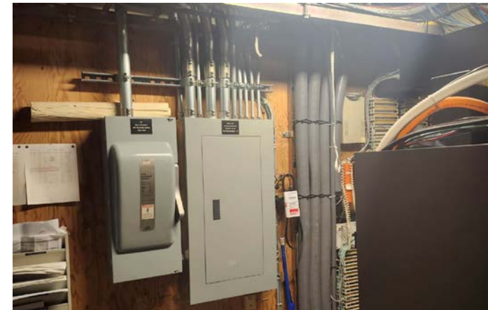
ZSFG Fire Alarm Head End