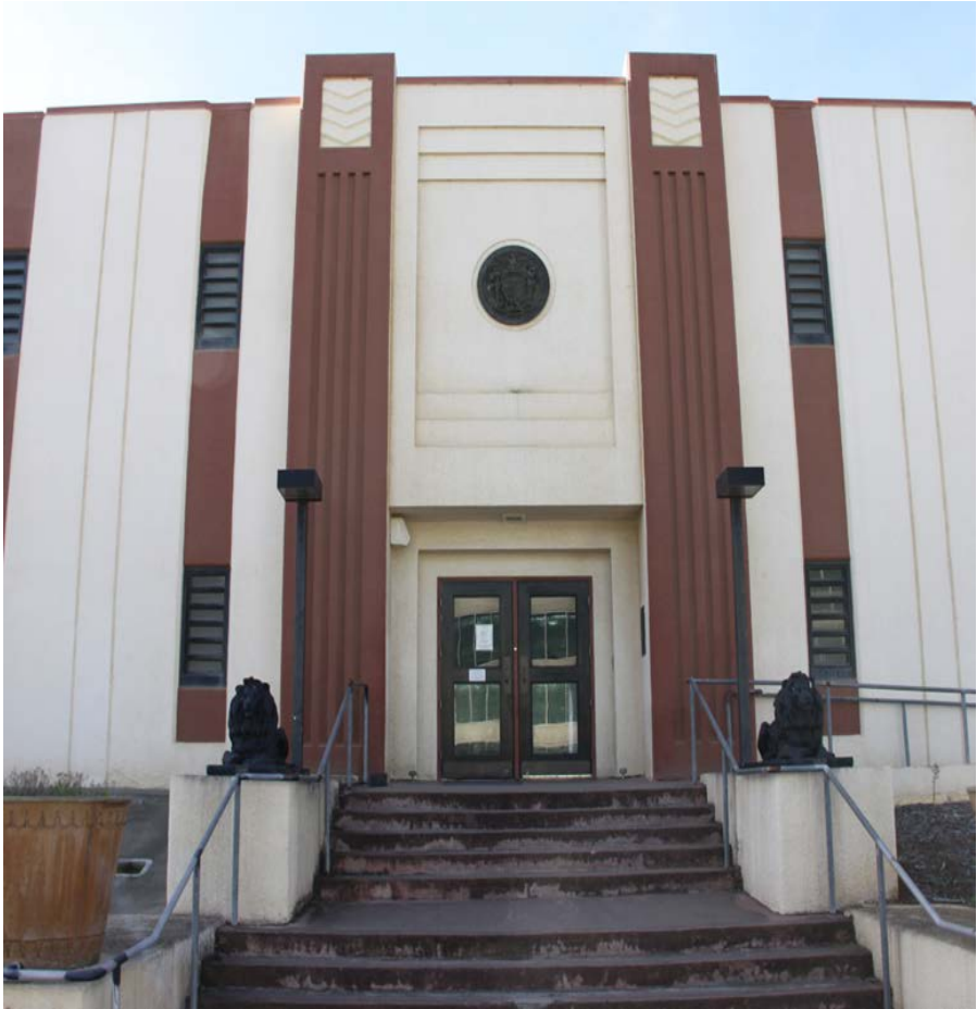
San Bruno Annex Entrance