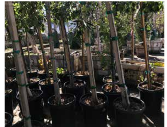
Street Tree Planting