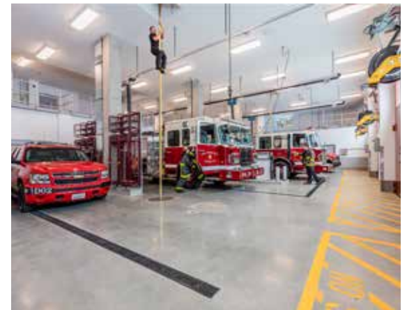
Inside Fire Station 5