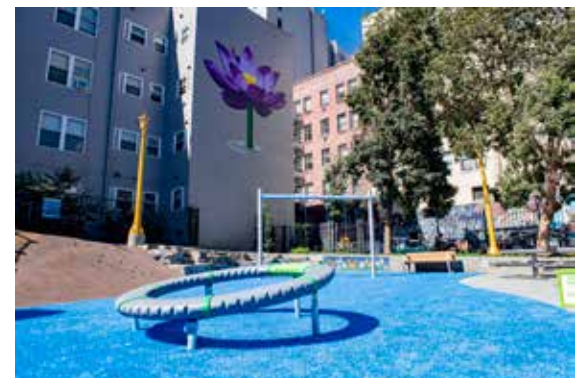
John Macaulay Park