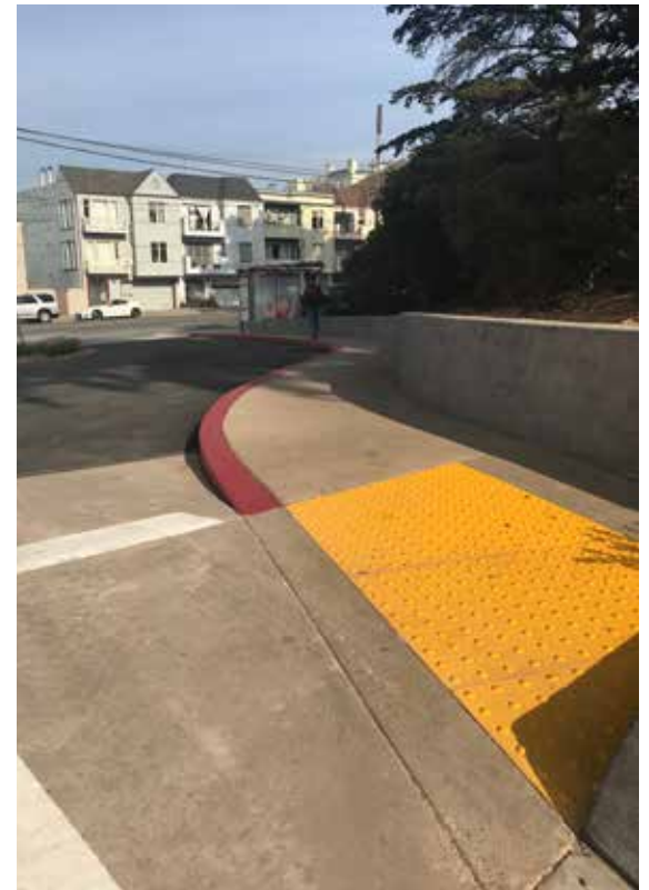
New Curb Ramp