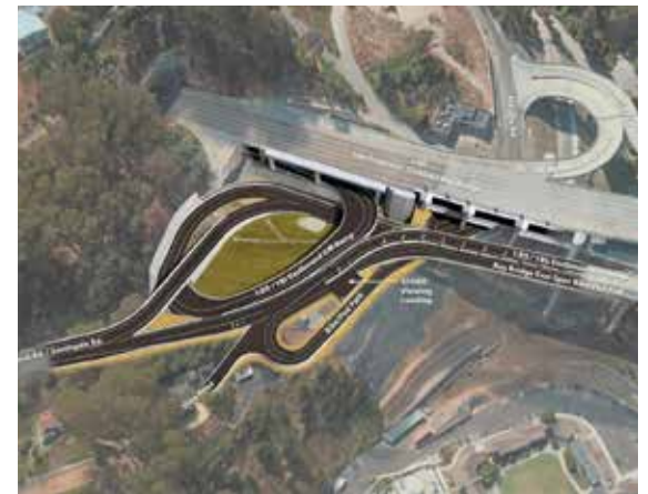
1 Southgate 3D