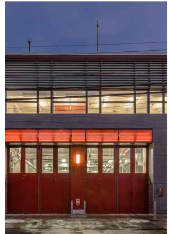
Fire Station 16