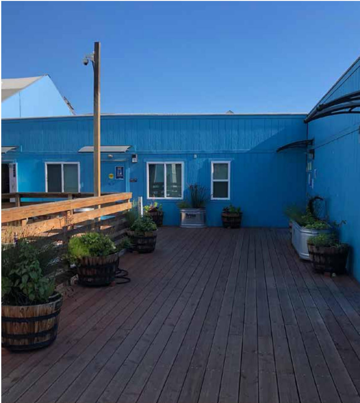
Division Circle Navigation Center