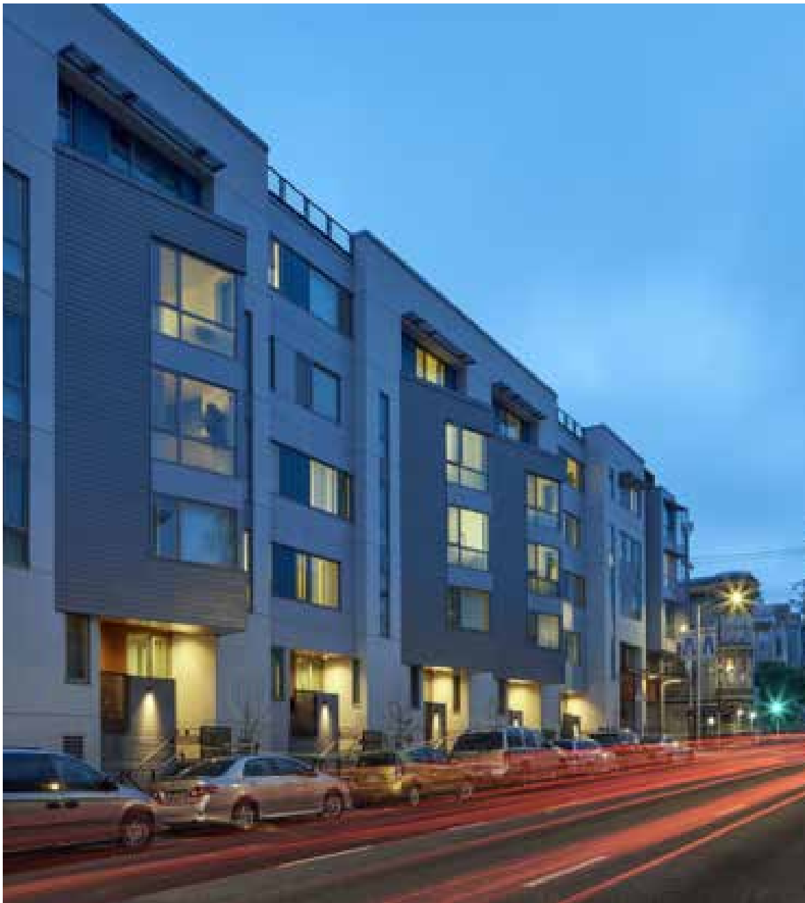
455 Fell Street