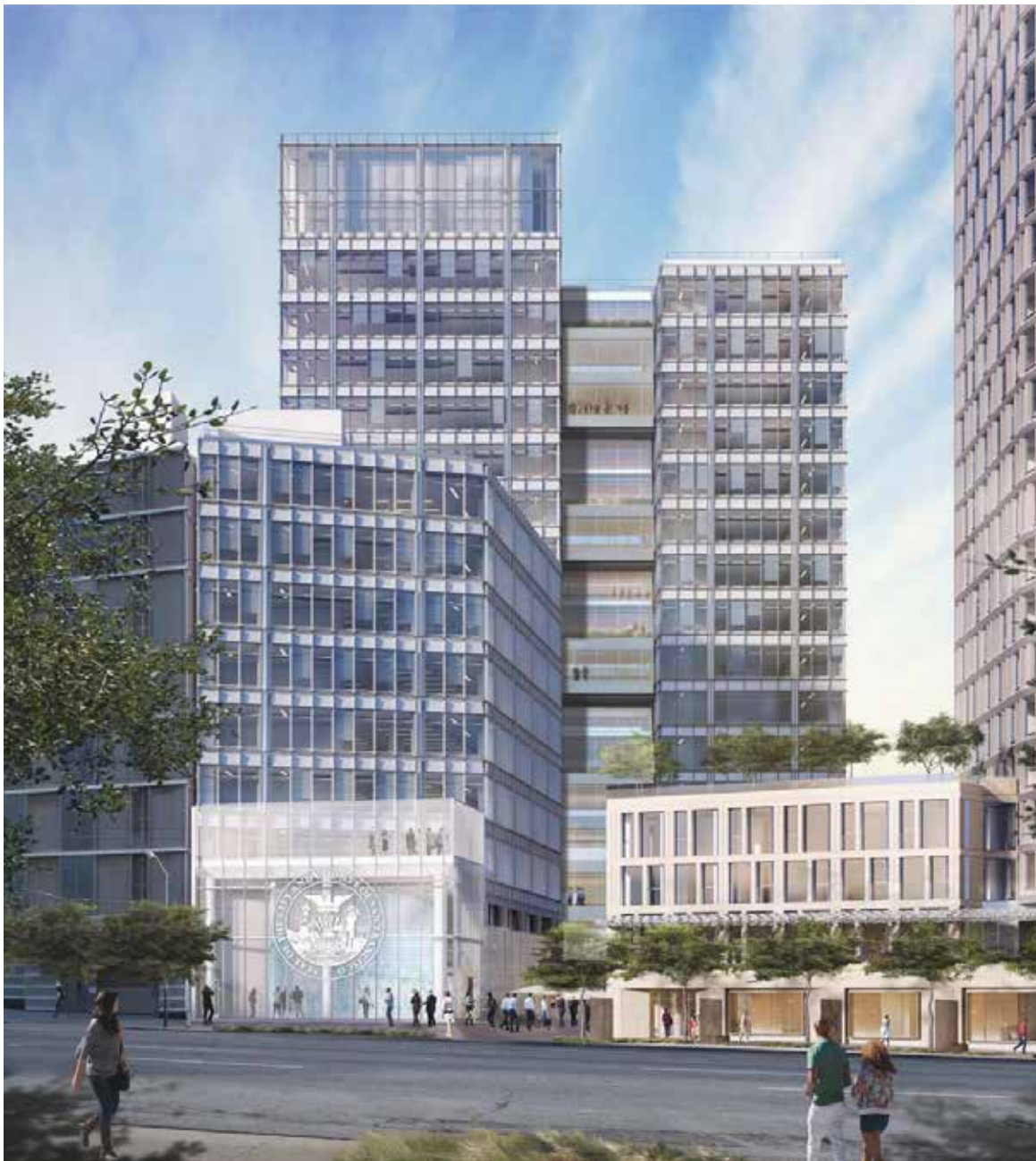
49 South Van Ness