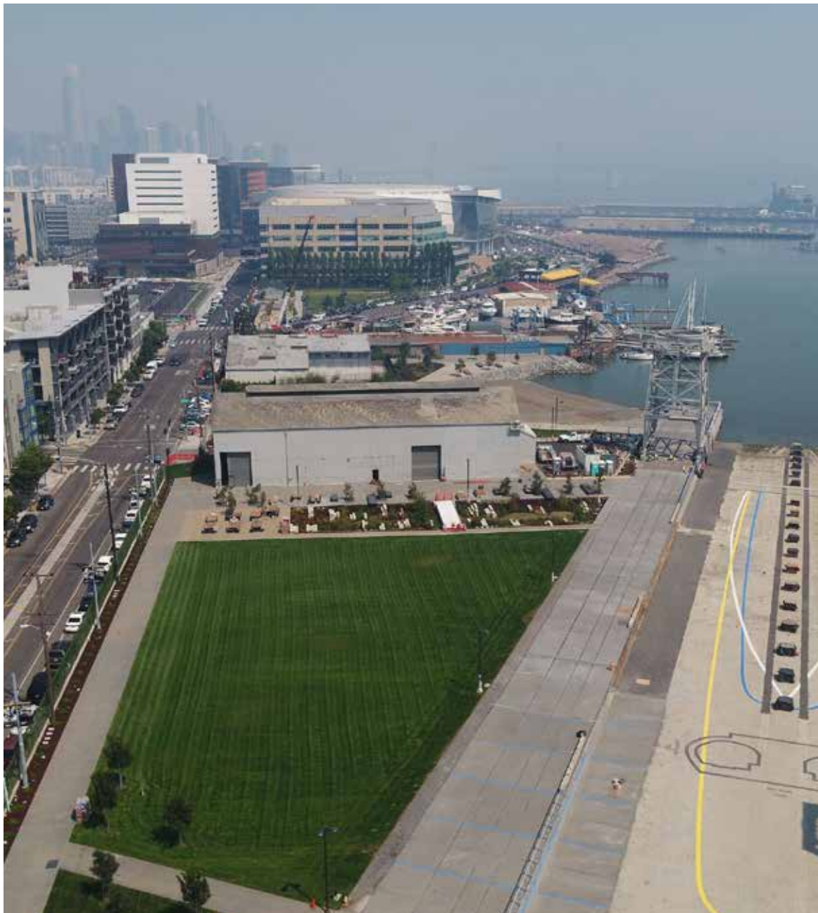
Crane Cove Park