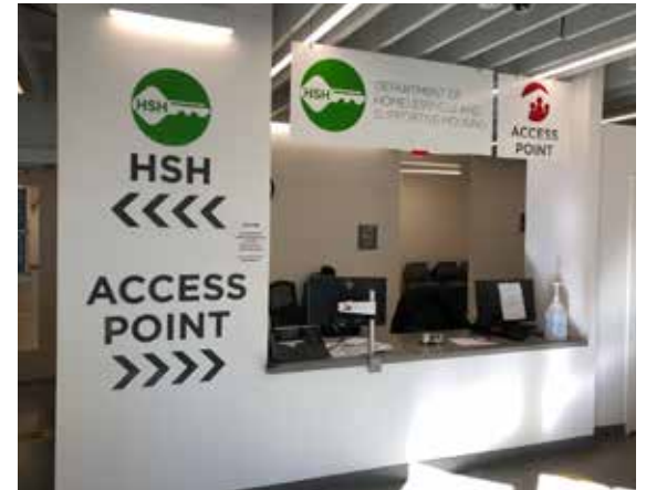
HSH Headquarters at 440 Turk Street