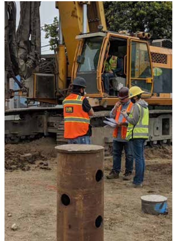
Construction at Maxine Hall Health Center