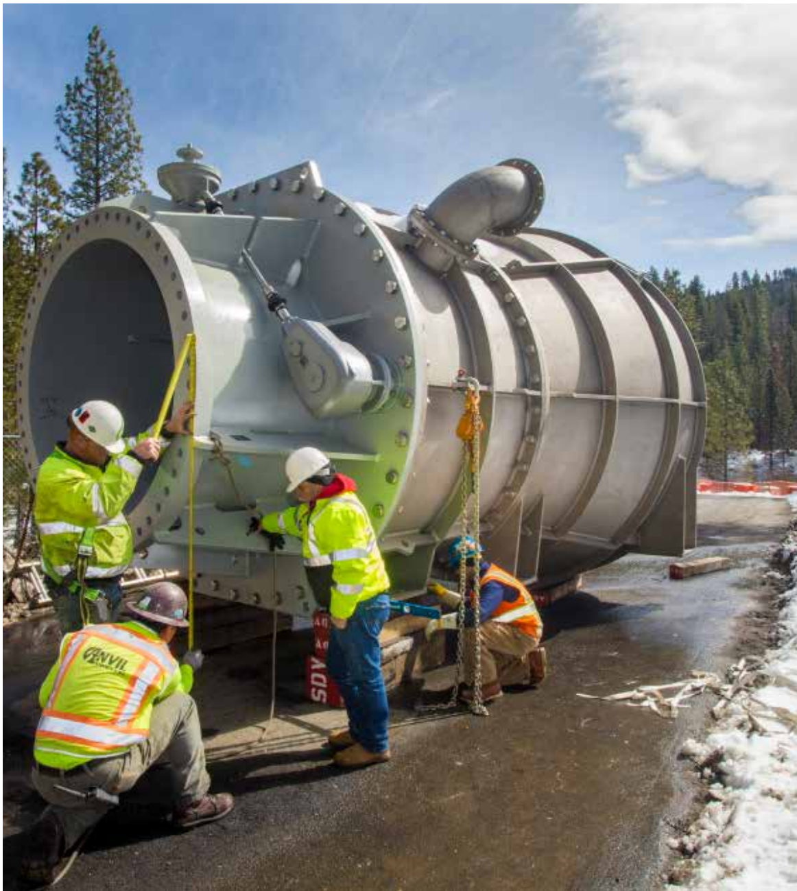
Cherry Dam Outlet Works Rehabilitation