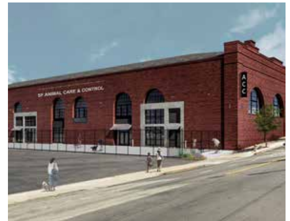
Animal Care and Control