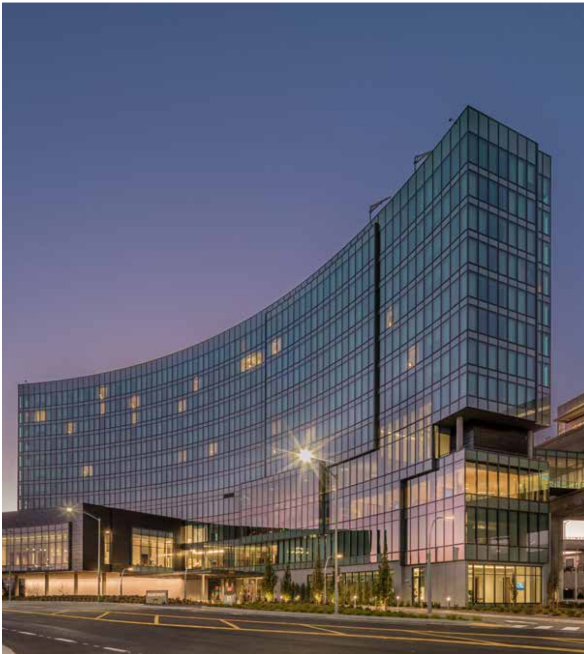
SFO Grant Hyatt Hotel