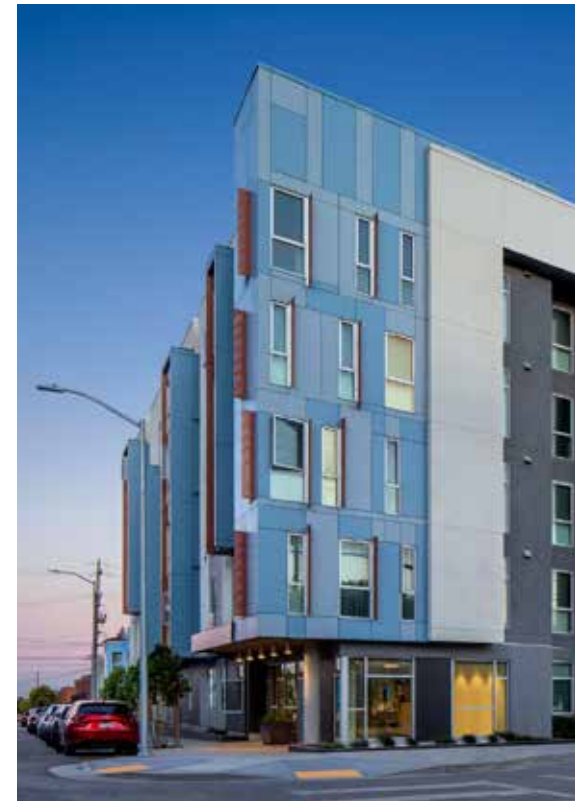
Sunnydale Parcel Q