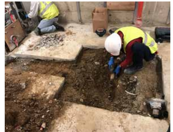
Mission Cultural Center for Latino Arts Elevator Work