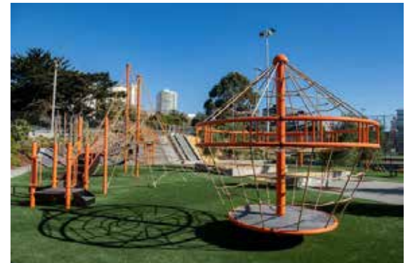
Margaret Hayward Playground