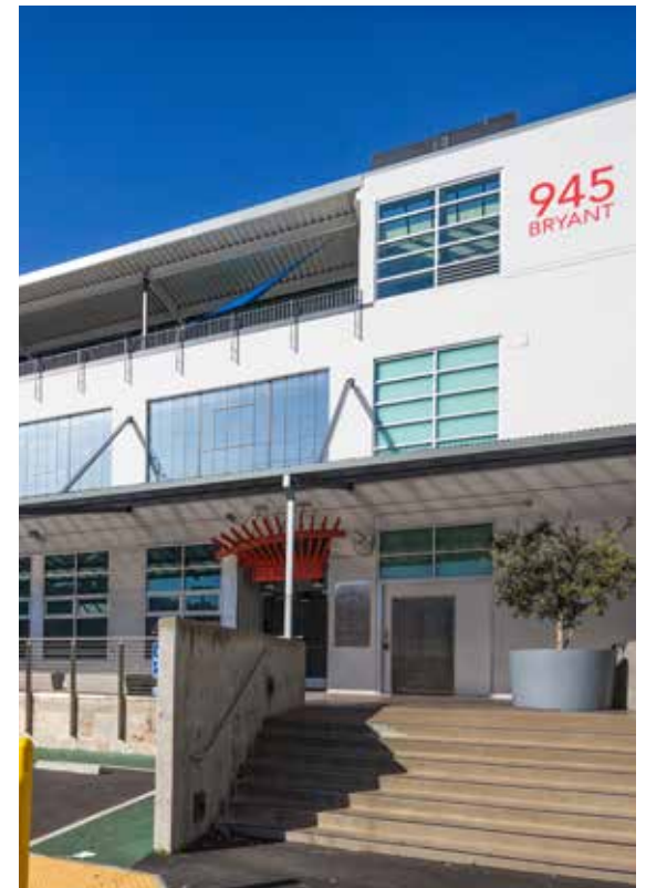
945 Bryant Street