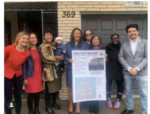
Small Sites Preservation 369 3rd Avenue