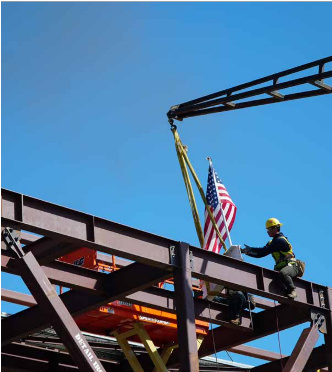
Fireboat Station 35 Topping Off Ceremony