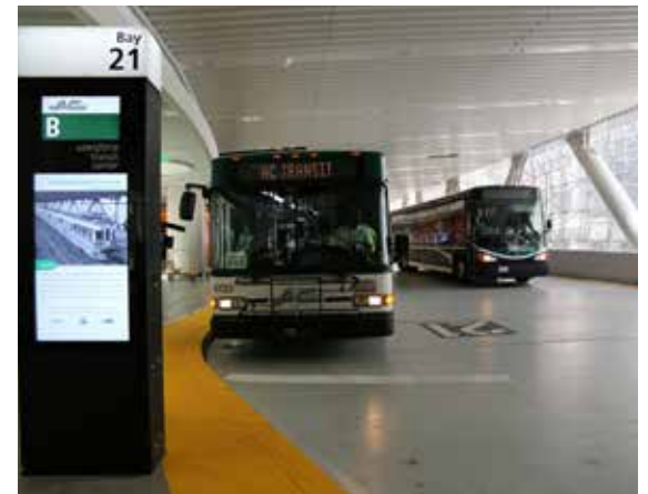
Transbay Bus Terminal