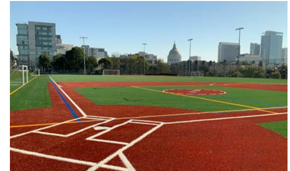
Margaret Hayward Park