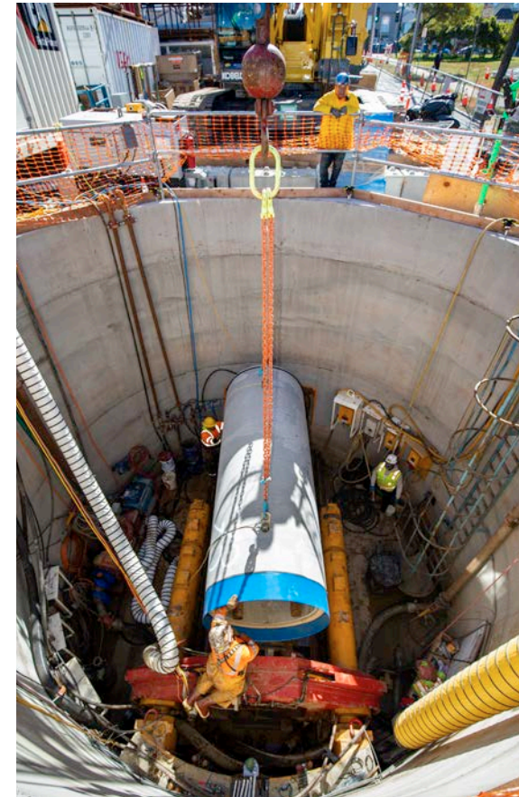
Construction at Wawona Vincente

Table 5.3 shows the currently planned amount of revenue bonds to be issued over the 10-year term of this Plan. All revenue bond issuances are subject to change based on market conditions and cash flow needs of the associated projects.