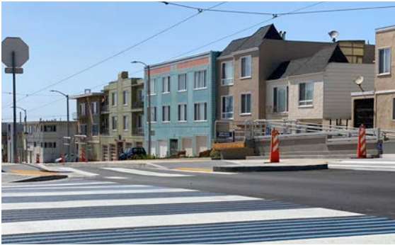
L Taraval Street Improvements

For details about the policies that govern the planning for the Pay-Go Program, the General Obligation Bond Program, and the General Fund Debt Program, as well as general policies for the Plan overall, please refer to the Introduction.