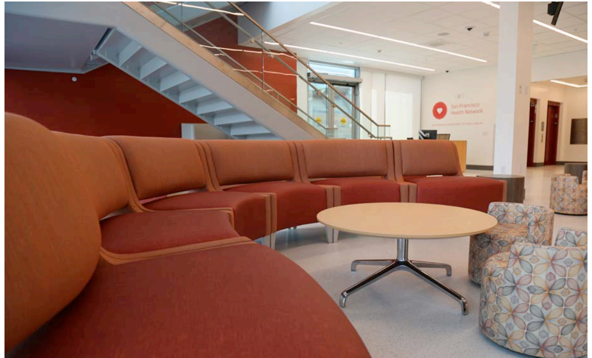
Southeast Health Center

The Plan structures the G.O. Bond schedule around the notion of rotating bond programs across areas of capital need, although the City's debt capacity, election schedules, and capital needs also inform these levels. This approach