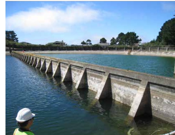
Twin Peaks Reservoir