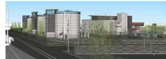
Biosolids Digester Facilities