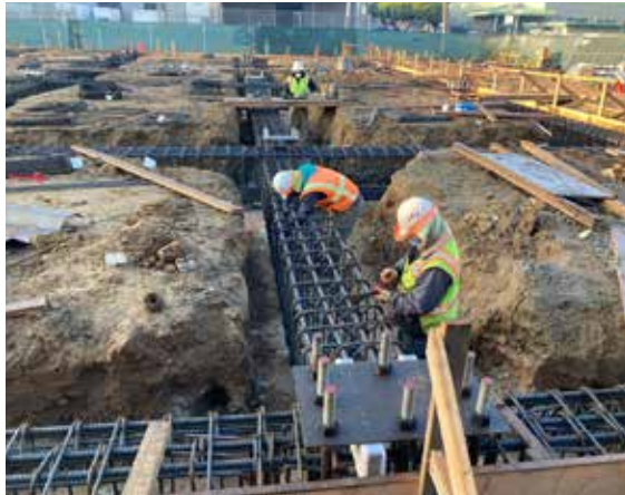
Construction at South East Health Center