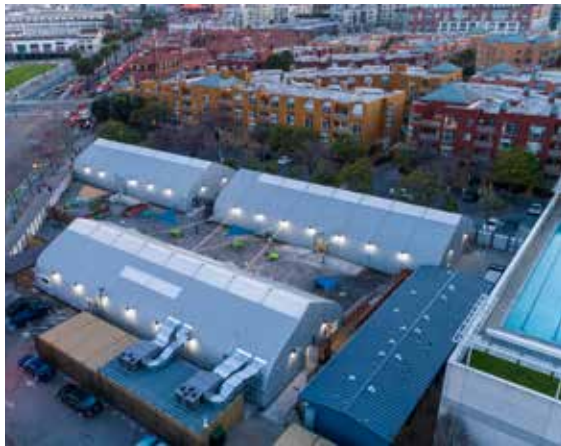
Embarcadero SAFE Navigation Center