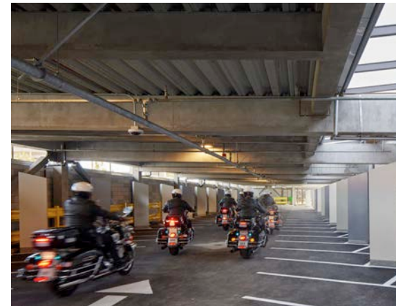
Traffic Company and Forensic Services Division