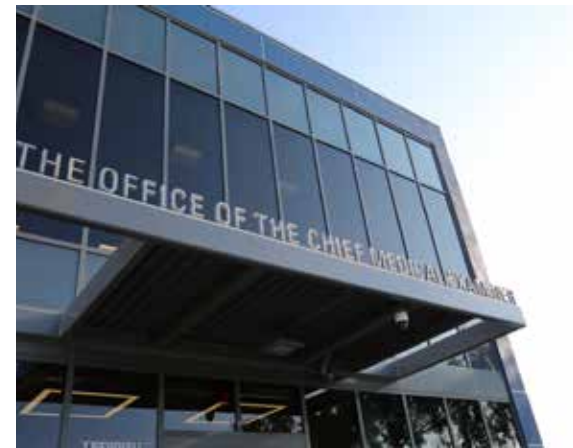
Office of the Chief Medical Examiner