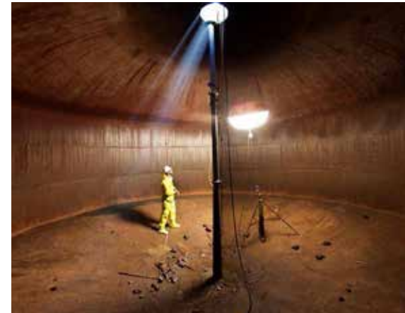
Emergency Firefighting Water System Cistern

Since the last Capital Plan, the City has taken several significant steps towards the closure of the HOJ. To vacate the building as expediently as possible per direction from the City Administrator, staff from the District Attorney, Police, and Adult Probation departments are relocating to leased space. Their exit, combined with the recent relocation of the Office of the County Medical Examiner in 2017, and the forthcoming Traffic Company and Forensic Services Division building departure in 2021, both funded by ESER 2014, will leave reduced operations in the building. Capital investments to end the reliance of the downtown justice campus on the HOJ have also begun. The renewal of the County Jail #2 kitchen was funded with General Fund as part of the Capital Budget in FY2019. Certificates of Participation (COPs) were authorized to acquire and prepare a new facility for the Police's Evidence and Property operations. COPs also enabled the purchase of parcels across Harriet Street from the HOJ.