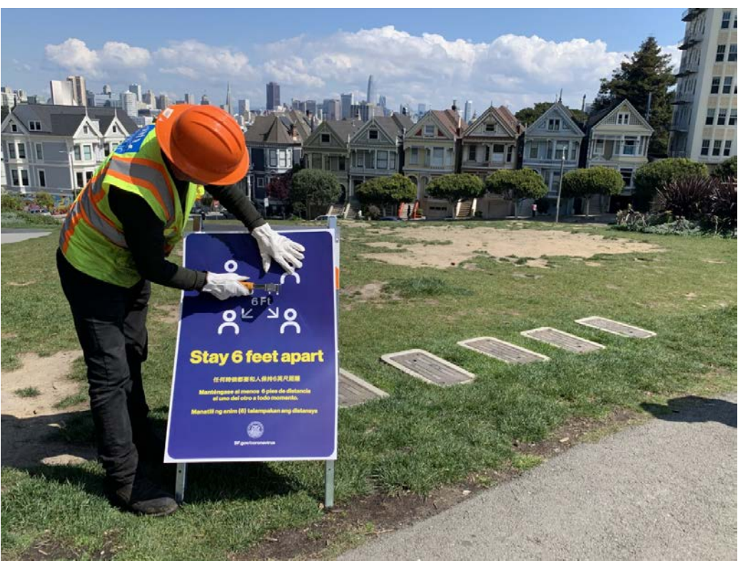
A sign reminds park users of social distancing to mitigate the spread of COVID-19

According to an analysis by the California Department of Finance for 2021, the overall state population has declined for the second time in history since its founding, largely driven by declining birth rates, decreased international migration, and increased deaths from COVID-19<sup>2</sup>. The overall reduction in population, which is most significant in the San Francisco Bay Area, has been attributed to less people moving to the area rather than any new pattern of exodus, a noted pre-pandemic trend.