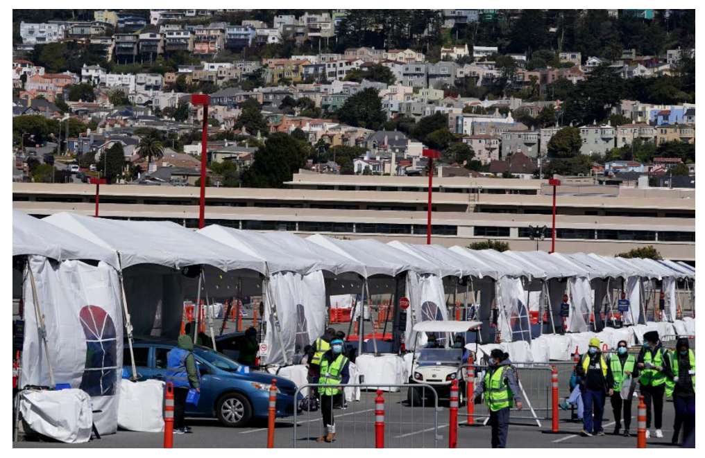
Mass vaccination site at San Francisco City College