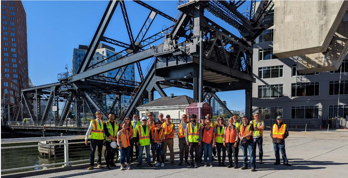
Sea Level Rise and Flood Hazards Coordinating Committee at Third Street Bridge