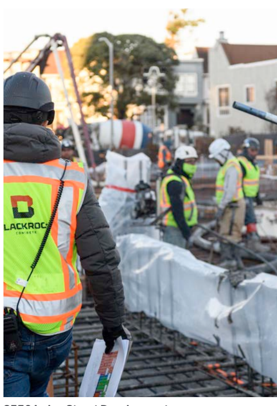
2550 Irving Street Development

New production of permanently affordable homes occurs primarily through one of a few mechanisms: units produced through San Francisco's inclusionary zoning requirements, MOHCD's multifamily lending program, and OCII-supported new multifamily production.