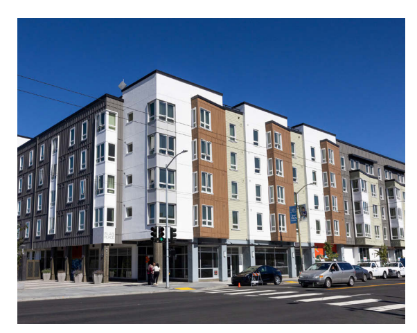
4840 Mission Street Bridge Housing

PASS Program: MOHCD manages one amortizing debt product called Preservation and Seismic Safety (PASS) Program that provides below-market rate debt to acquisition/preservation projects, thereby reducing the need for direct capital subsidy.