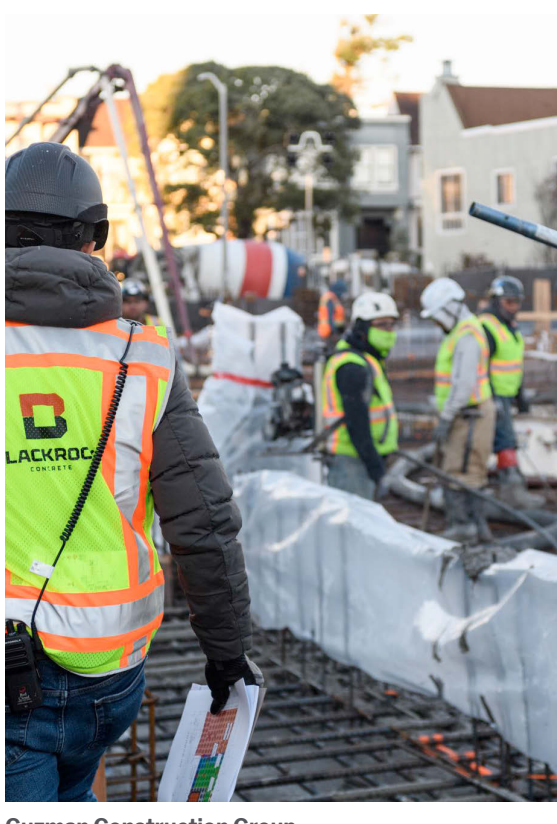
Guzman Construction Group

New production of permanently affordable homes occurs primarily through one of a few mechanisms: units produced through San Francisco's inclusionary zoning requirements, MOHCD's multifamily lending program, and OCII-supported new multifamily production.