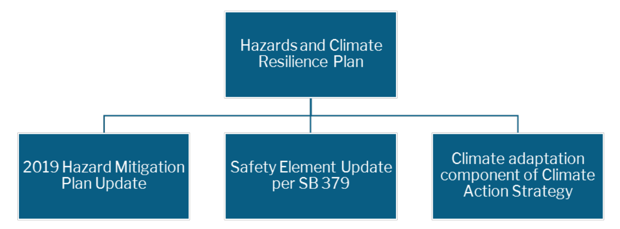
FIGURE 2-1: HAZARDS AND CLIMATE RESILIENCE PLANNING NEEDS

The HCR development process also sought to achieve the outcomes listed below.