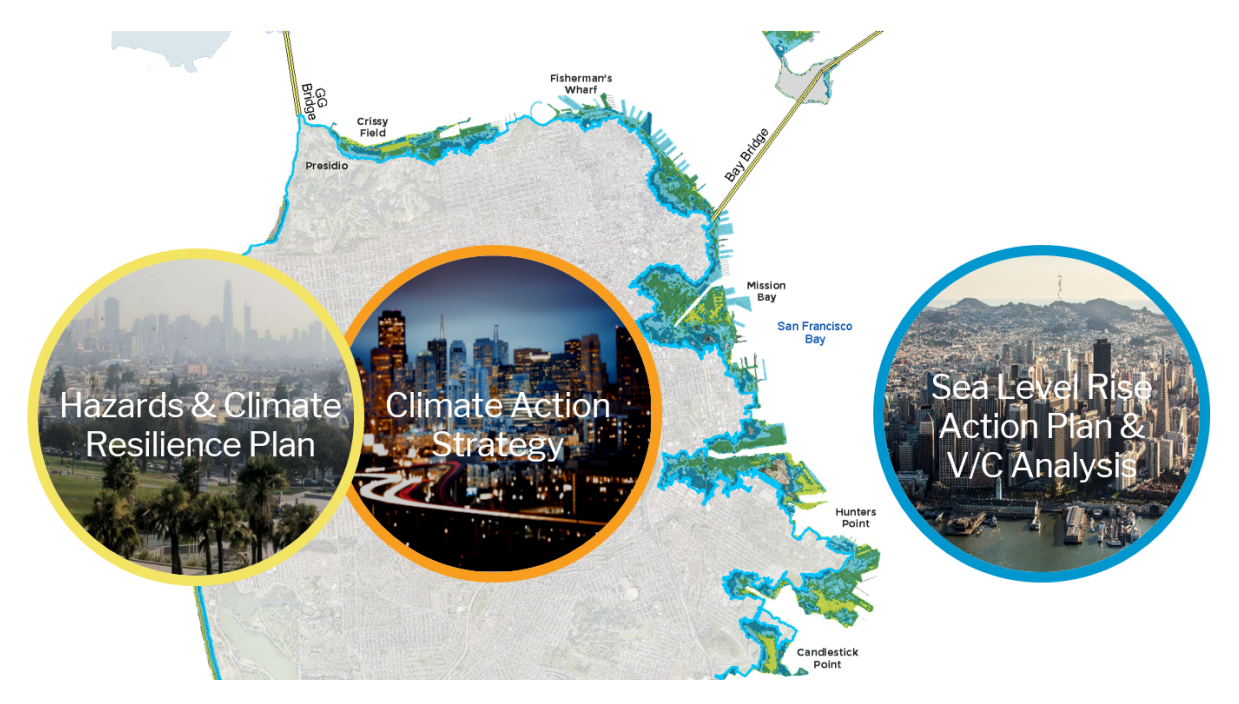
FIGURE 2-4: RESILIENCE PLANNING AT THE CITYWIDE SCALE

Appendix A. The ongoing effort to update the City's Climate Action Strategy (CAS) is coordinating with the HCR through a new Inter-Agency Climate Resilience Program aimed at improving the integration of climate adaptation and climate mitigation (greenhouse gas reduction) efforts. Upon the completion, key synergistic CAS and HCR strategies will be identified and pursued through a Citywide Climate Resilience framework.