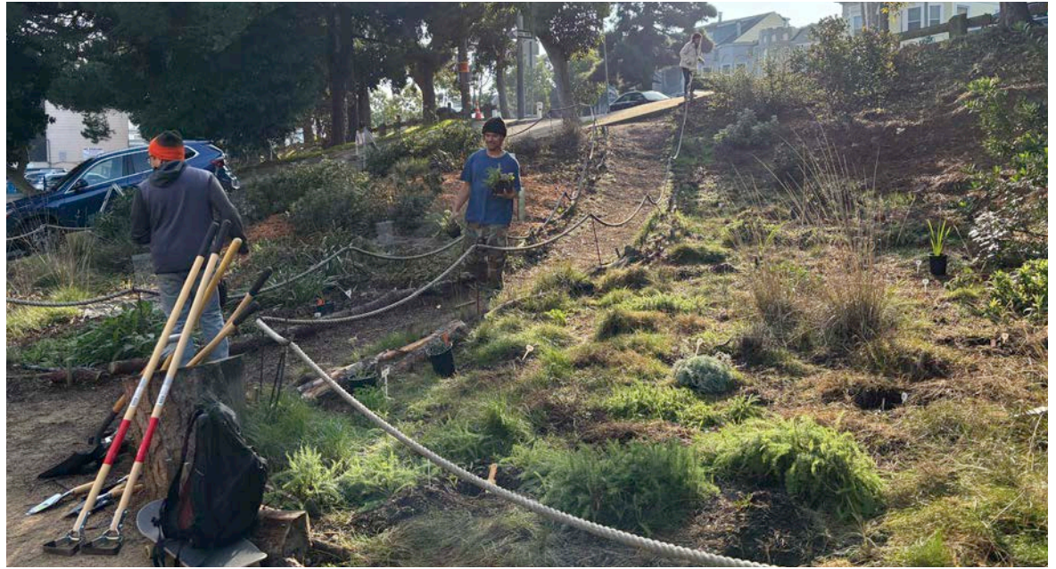
Glen Park Greenway Planting

Taking care of our capital infrastructure is an important part of building a resilient city. Resilience includes eliminating racial and social disparities so that all San Franciscans may recover and thrive no matter the shocks and stresses they face. The Capital Plan strives to fund projects and programs that address