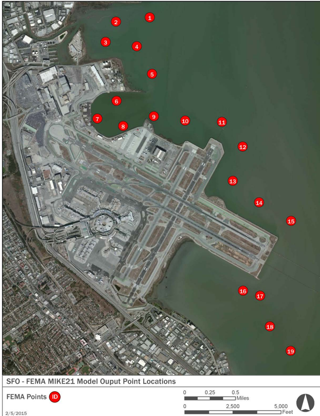
Figure 4: Tide Calculation Locations for SFO

This section provides the existing tidal elevations at specific points along the Bay shoreline of the San Francisco International Airport (SFO), as well as the calculation of flood heights under storm surge conditions for 1-year to 500-year storm events. The data are presented relative to the City datum (ft-SFCD) and ft-NAVD88. The data in this attachment does not include values that would occur under any sea level rise scenarios. This data is presented with permission from SFO (2014).