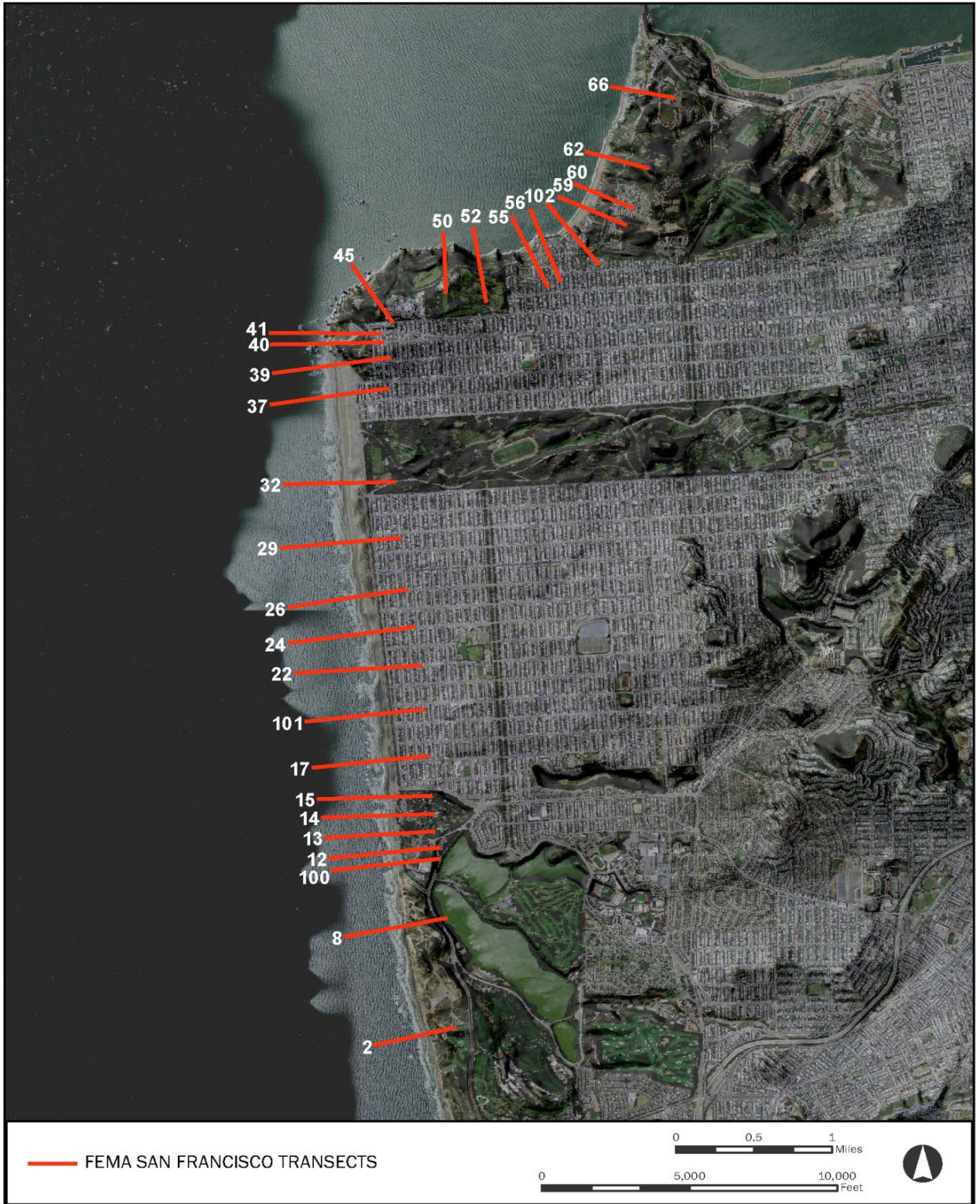
Figure 3: Existing Conditions Extreme Dynamic Water Levels and Total Water Levels for the Westside SFPUC Shoreline